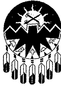
TREATY No. 7