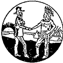
TREATY No. 6