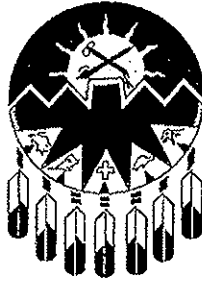
TREATY No. 7