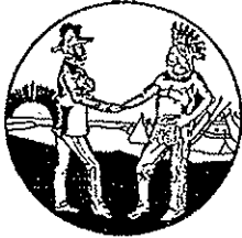
TREATY No. 6