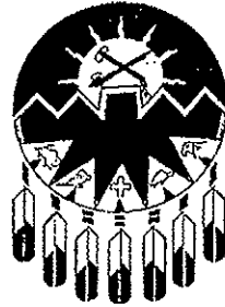
TREATY No. 7