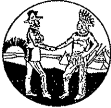
TREATY No. 6