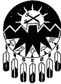
TREATY No. 7