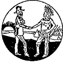
TREATY No. 6