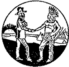
TREATY No. 6