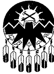
TREATY No. 7