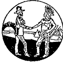
TREATY No. 6