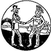
TREATY No. 6