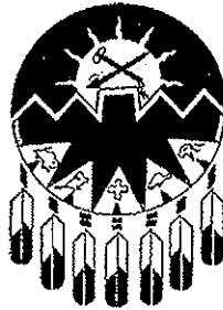
TREATY No. 7