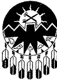
TREATY No. 7