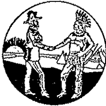
TREATY No. 6