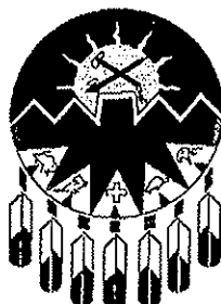
TREATY No. 7