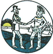
TREATY No. 6