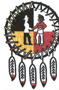
TREATY No. 8