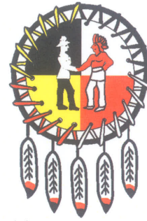
TREATY No. 8